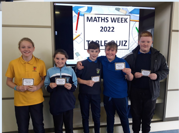
The winning 6th Class Team