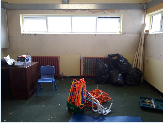
Ready for Phase Two– Painting!